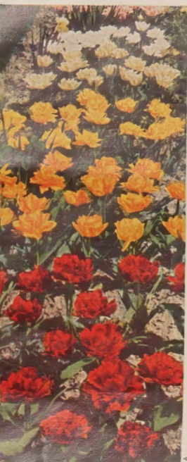
Group of Double Early Tulips

100 HOLLAND BULBS for only $6.25 12 for 85c 25 for $1.60